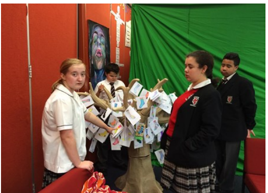
Decorating the Belonging Tree